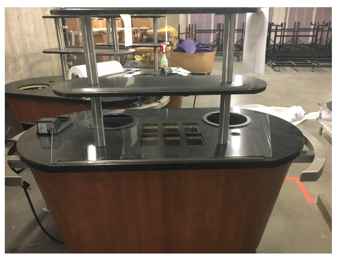
Item #1 Carts of Colorado Custom-made dessert carts