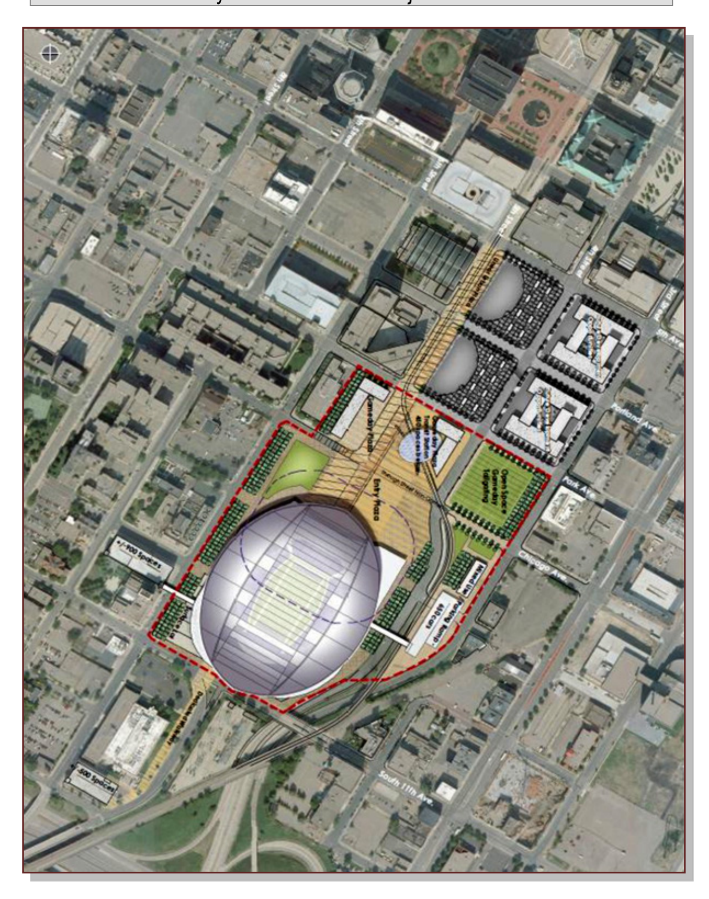
Exhibit A: Preliminary Site Plan for the Project