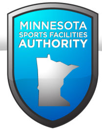
Exhibit B MEMORANDUM